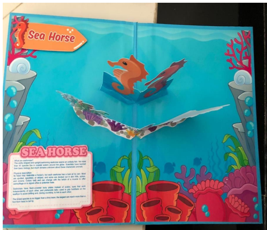
Figure 8. Top View of Fourth Page Description of Seahorse