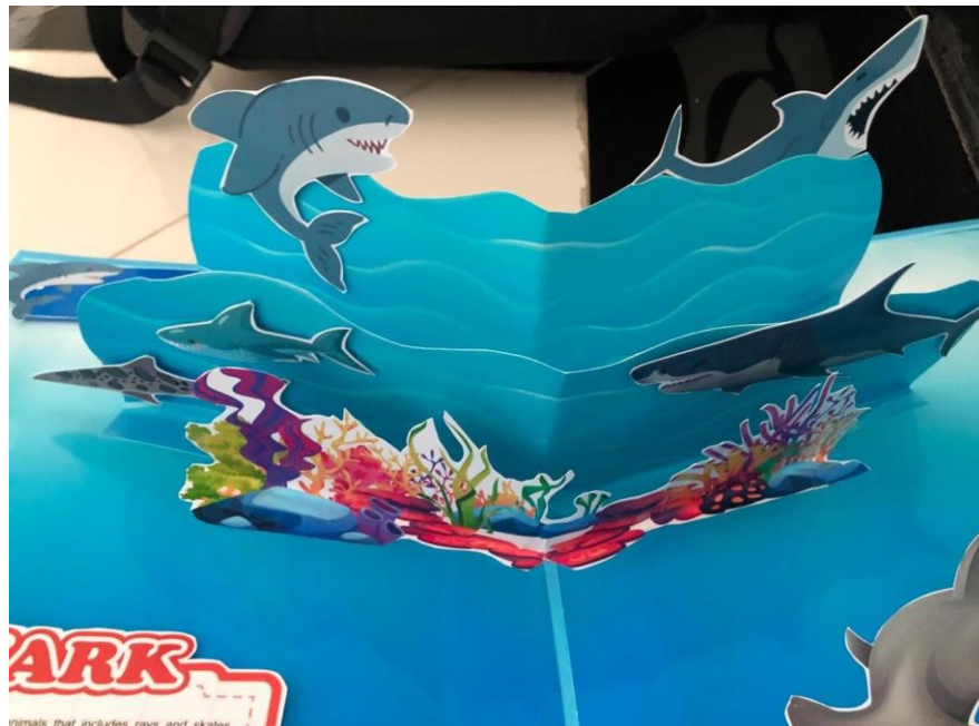
Figure 7. Side View of the Third Page of the Shark