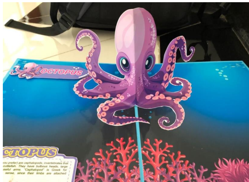
Figure 5. Side View of the Second Page of the Octopus