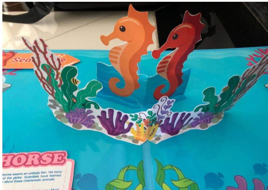
Figure 9. Side View of the Fourth Page of the Seahorse