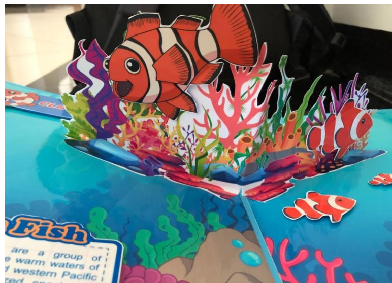
Figure 3. Side View of the First Page of the Clownfish