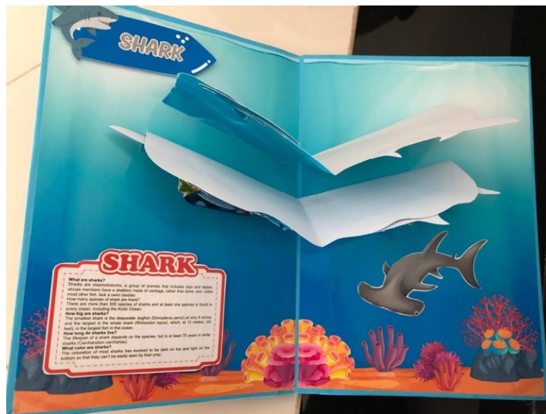
Figure 6. Top View of Third Page Description of Shark