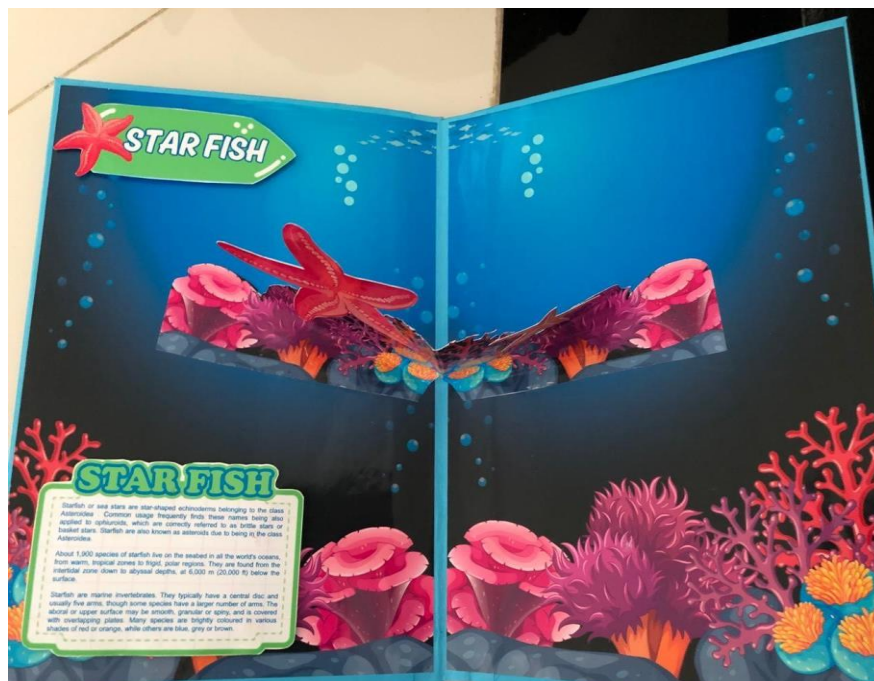
Figure 10. Top View of Fifth Page Description of Starfish