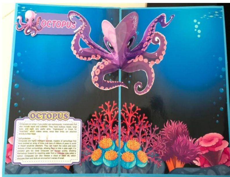
Figure 4. Top View of Second Page Description of Octopus