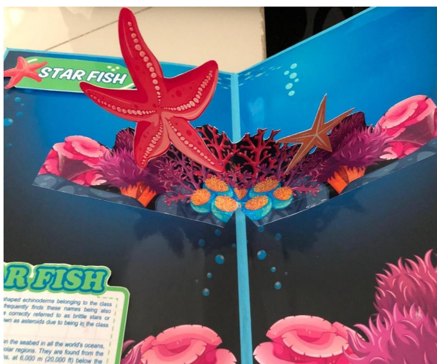
Figure 11. Side View of the Fifth Page of the Starfish