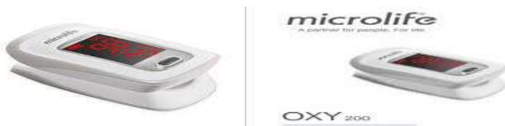
Figure 3. Functional Heart Tests

2. Post-Exercise Heart Rate: Measured using the Beep Test (20 m shuttle run). The athlete runs back and forth with increasing speed guided by audio signals. After completing 8 laps, heart rate is measured using the Microlife OXY 200 device.