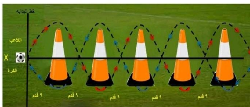
شكل (1) يوضح اختبار الدحرجة بكرة القدم

The student's average time spent on both attempts